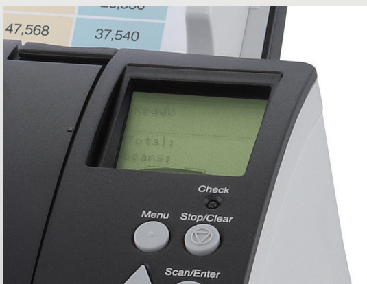
Integrated LCD operating panel

The fi-7180, fi-7280, fi-7160 and fi-7260 come with Scanner Central Admin tools that includes functions that system administrators can use to manage the installation and operation of multiple scanners, monitor operation status and update drivers and software from one location. This ability dramatically reduces the cost and work that goes into setting up, operating and maintaining many scanners in an organisation and also in expanding the scanner network to multiple locations.