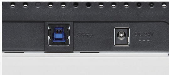
High speed performance through USB 3.0 interface

All four scanner models additionally make use of an ultrasonic sensor that accurately detects multifeed errors where two or more sheets are fed through the scanner at once plus intelligent multifeed function that is designed for documents that intentionally feature paper attachments of defined sizes or locations such as sticky notes or photos. The scanner can automatically recognise the location of the attachment and will then exclude that zone from triggering alert conditions.