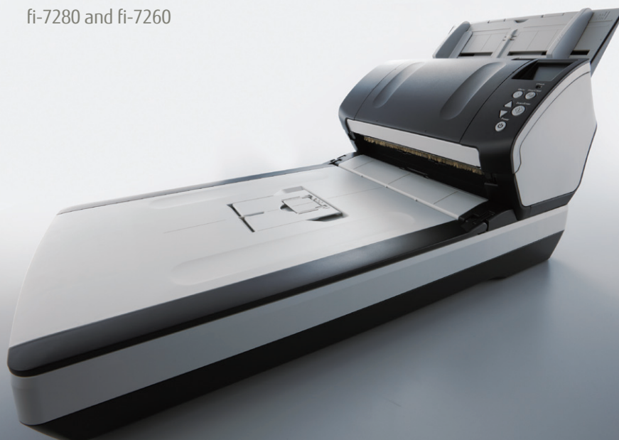
fi-7280 and fi-7260

Carrier sheets allow you to scan documents, larger than A4 or photos and clippings that are at risk of being damaged when processed through an ADF. {Part Number – PA03360-0013}