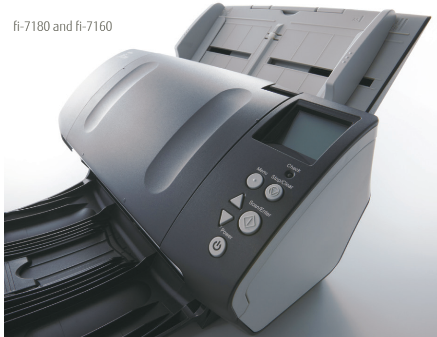
fi-7180 and fi-7160